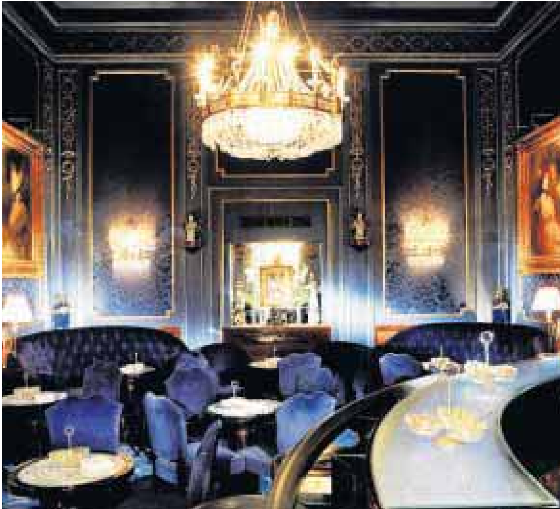
Above, Hotel Sacher in Vienna (4)