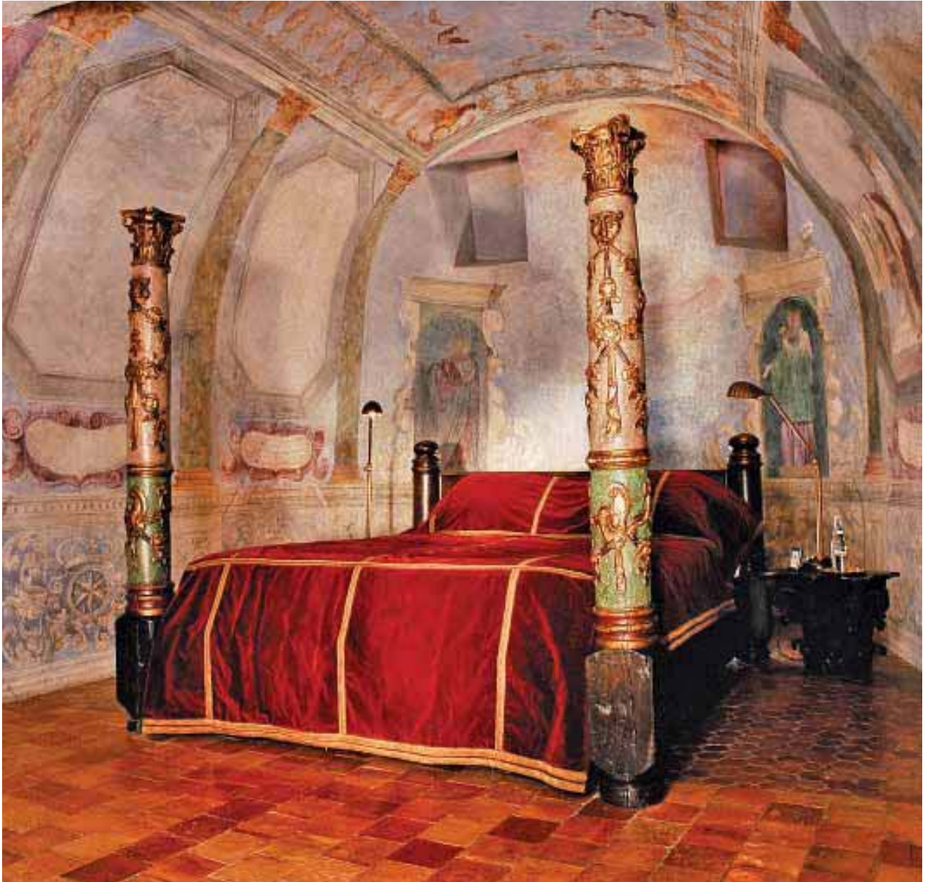
Object of desire An antique four-poster bed, above, at the Château de Bagnols, near Lyons (1). Right: sheer opulence prevails at the Hotel Sacher in Vienna (4)

Copyright material. This may only be copied under the terms of a Newspaper Licensing Agency agreement ( www.nla.co.uk ) or with written publisher permission.